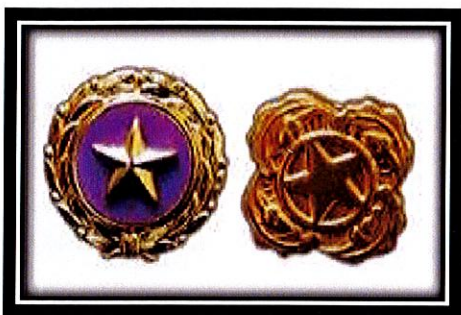
Gold Star Pins